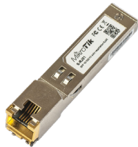
RJ45 SFP copper module