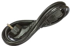
2 IEC cords