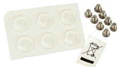
Screw and feet kit (K10)