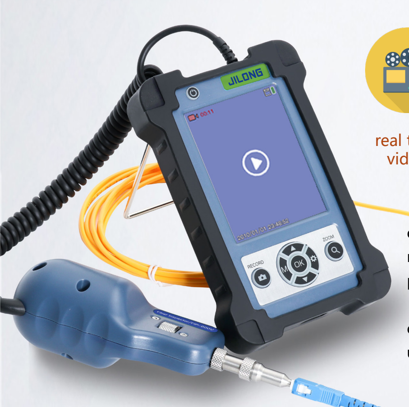
real time video

The angle of the bracket can be adjusted by rotation at will, which is stable and convenient. From the perspective of ergonomics, there is no need to watch on a single hand-held screen. In line with ergonom -ics, comfortable grip, compact, light and durable. Full enclosure design, cushioning impact friction. Close protection, anti-falling, anti-seismic.split type design is better on protection, reduce the damage by collising or dropping in a certain extent