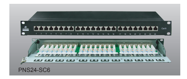
CAT6 shielded patch panel

The CAT6 patch panel is loaded with tool-less keystone jacks, which meet or exceed the transmission standard of CAT6. The performance is beyond CAT6 350 MHZ hardware connections standard and widely used in the horizontal cabling in equipment room and intermateable terminal.