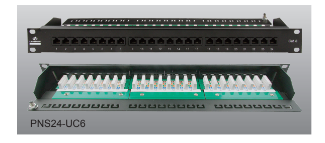
CAT6 unshielded patch panel