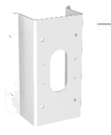
DS-1476ZJ-SUS Corner Mount